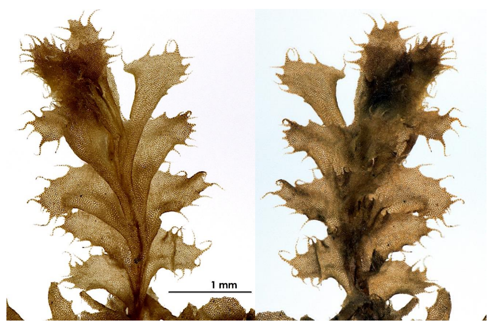
Fig. 1. Plagiochila subtropica, branch seen from dorsal (left) and ventral (right)

Keywords: bryophytes, liverworts, new record, Taiwan