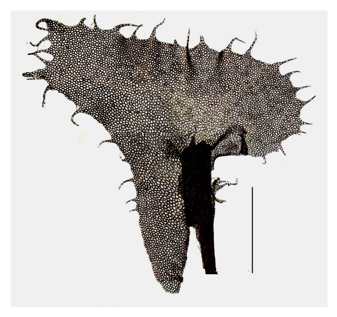
Fig. 2. Stem leaf -flattened - scale 1 mm

"paraphyllia-like" structure seen in Fig. 2 is a fragment of an incompletely removed dorsal leaf base.